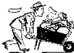
The rich man

Holding place for all Unsaved, Unregenerated Dead since all time.