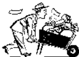
The rich man

Holding place for all Unsaved, Unregenerated Dead since all time.