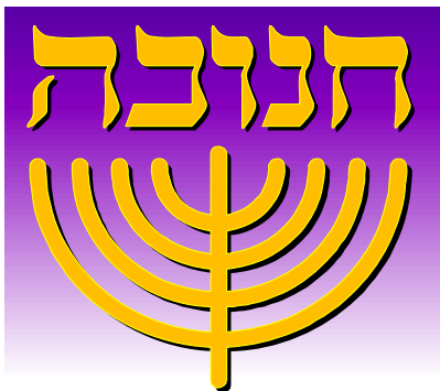
The Nine Branch Menorah is a Symbol of Hanukkah

The eight-branched menorah, candelabrum has become a symbol of the holiday. The Book of Second Maccabees, one of the earliest sources on the origins of Hanukkah, connects the eight days of the festival with the eight day observance of Sukkot, the feast of Tabernacles.