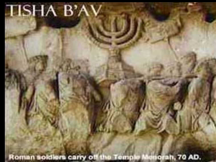
Roman soldiers carry off the Temple Menorah, 70 AD.

Destruction of the Second Temple The Second Temple of Yeshua's day was constructed by Herod and destroyed by the Romans in 70 A.D.